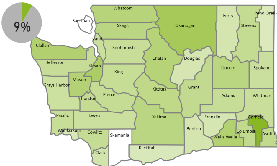
Skilled Nursing Facilities