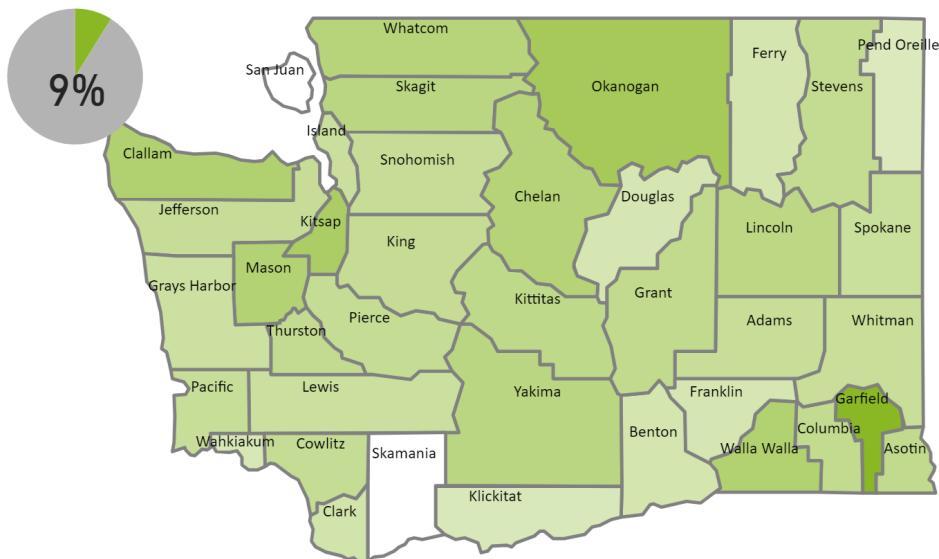
Skilled Nursing Facilities

Source: FMS and CARE data, as of 07/01/2023. Created by DSHS/ALTA/Office of Rates Management on 09/18/2023.