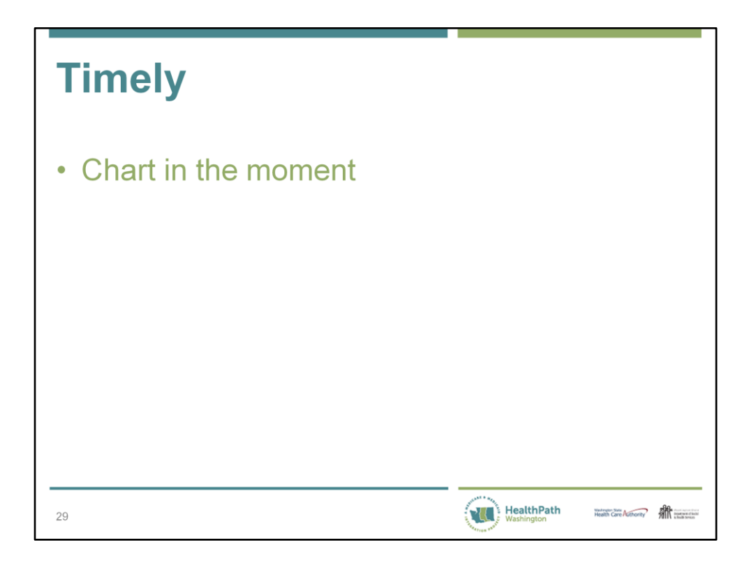
Chart in the moment. If you remember an important point after you've completed your documentation, chart the information with a notation that it is a "late entry" and include the date and time of the late entry.