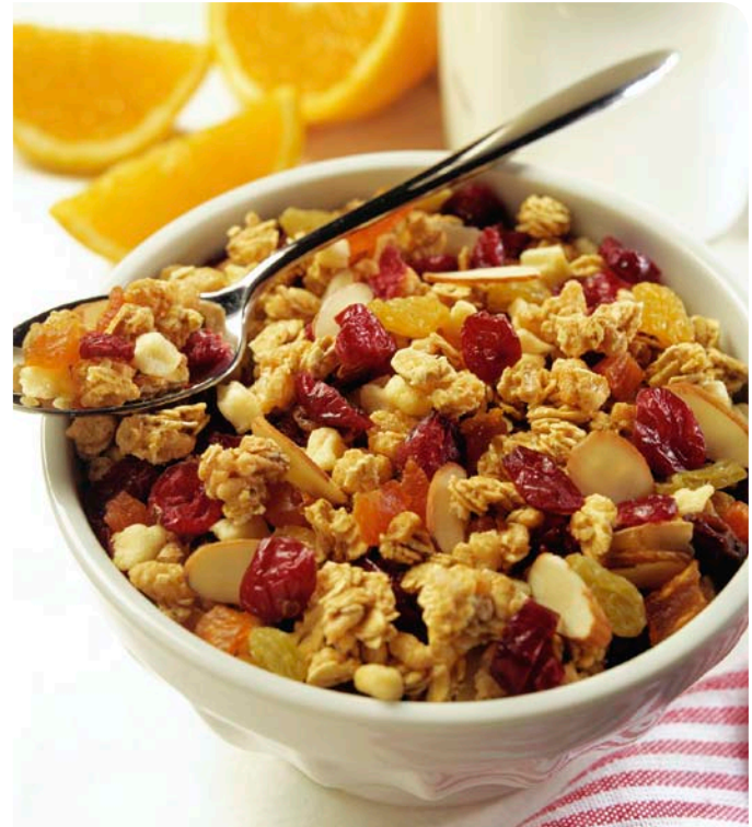
You can help improve your cholesterol by eating foods that are lower in saturated and trans fats.