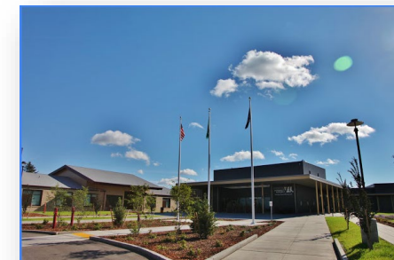
Walla Walla Veterans Home