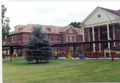
WA Soldiers Home - Orting