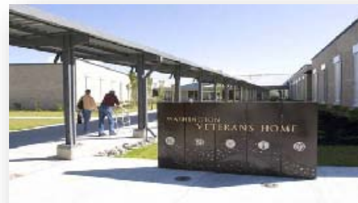
WA Veterans Home - Port Orchard