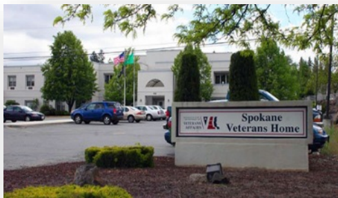
Spokane Veterans Home