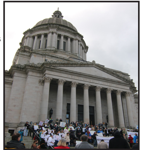
Advocacy Days January 2023

Advocacy Days are held virtually (via Zoom) during each legislative session to involve individuals with intellectual/developmental disabilities (IDD), their families, and their service providers in the legislative process.