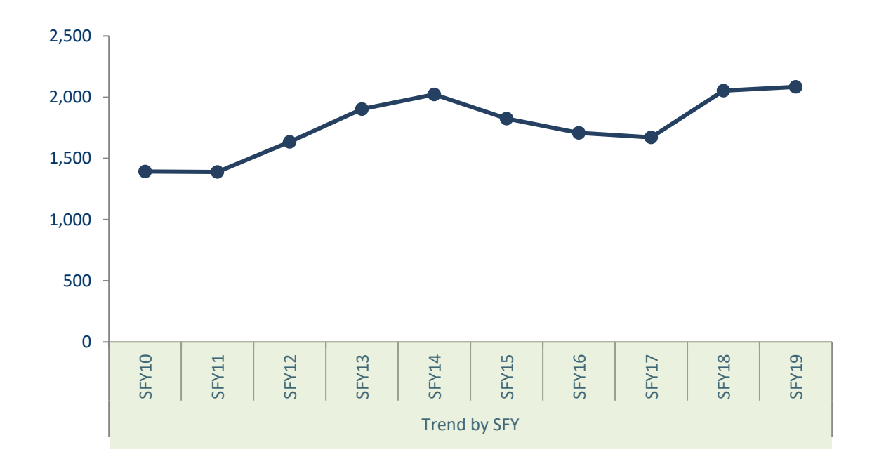
Domestic Violence Program Clients, SFY 2010 – 2019