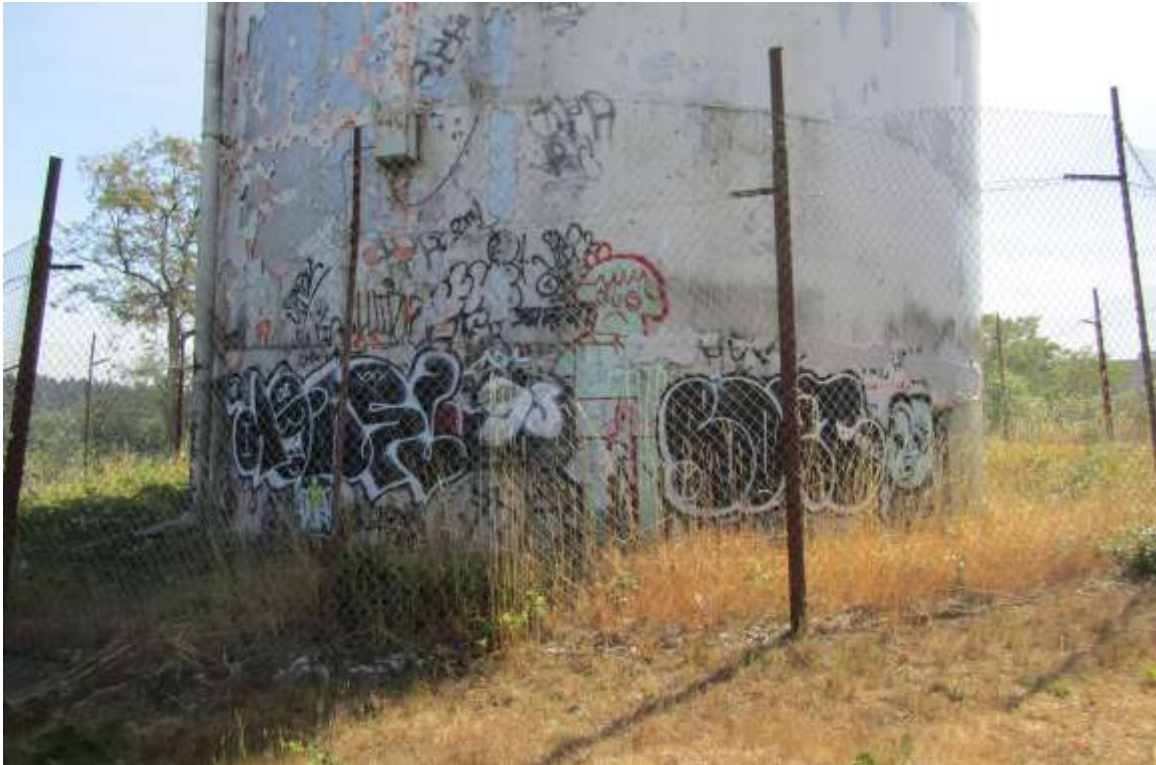
Photo shows the tank is secured with fencing. There is no signage on the fence. We recommend posting No Trespassing sign.