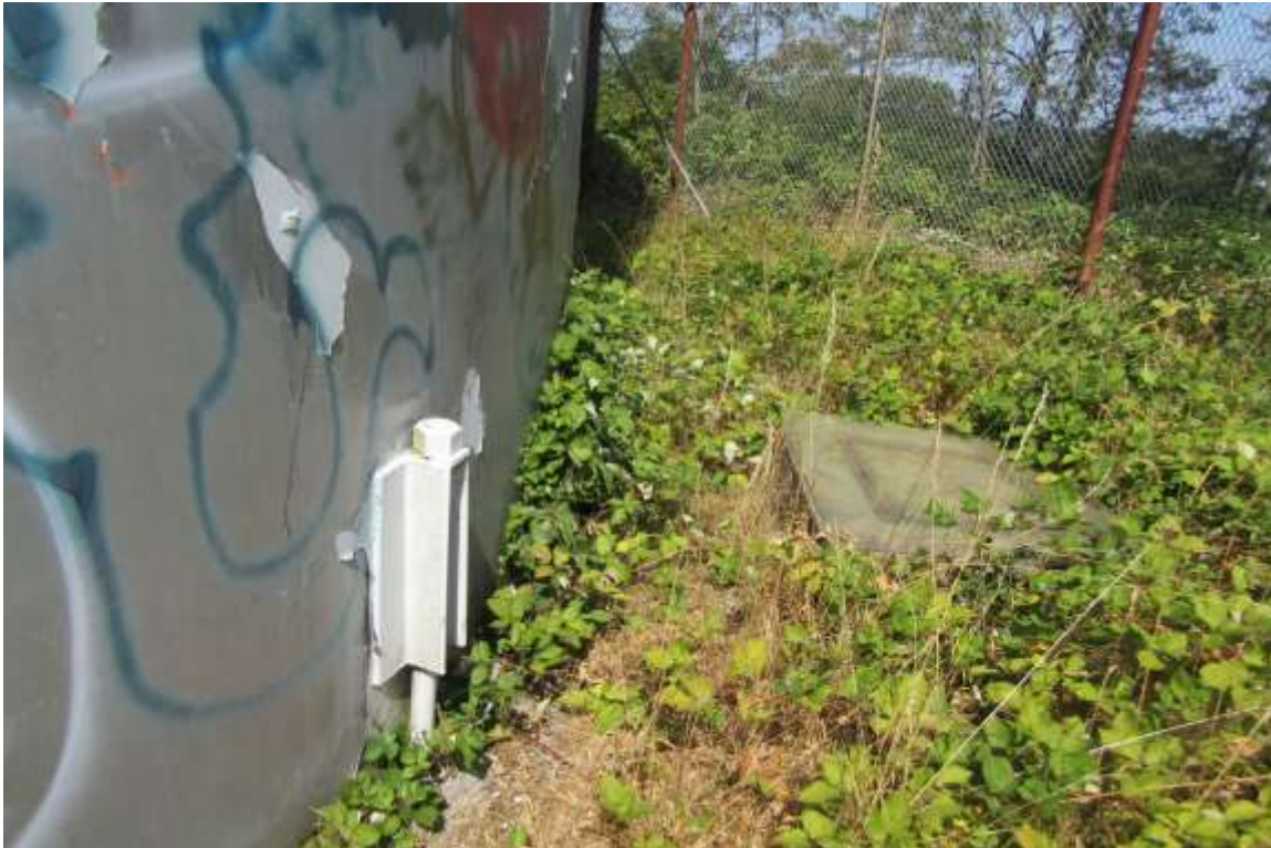
Photo shows the tank has no grounding system. We recommend electrically grounding the tank for lightning protection as required by OSH Act of 1970 Section 5 and NFPA 780-2017; 5.4 Metal Towers and Tanks .