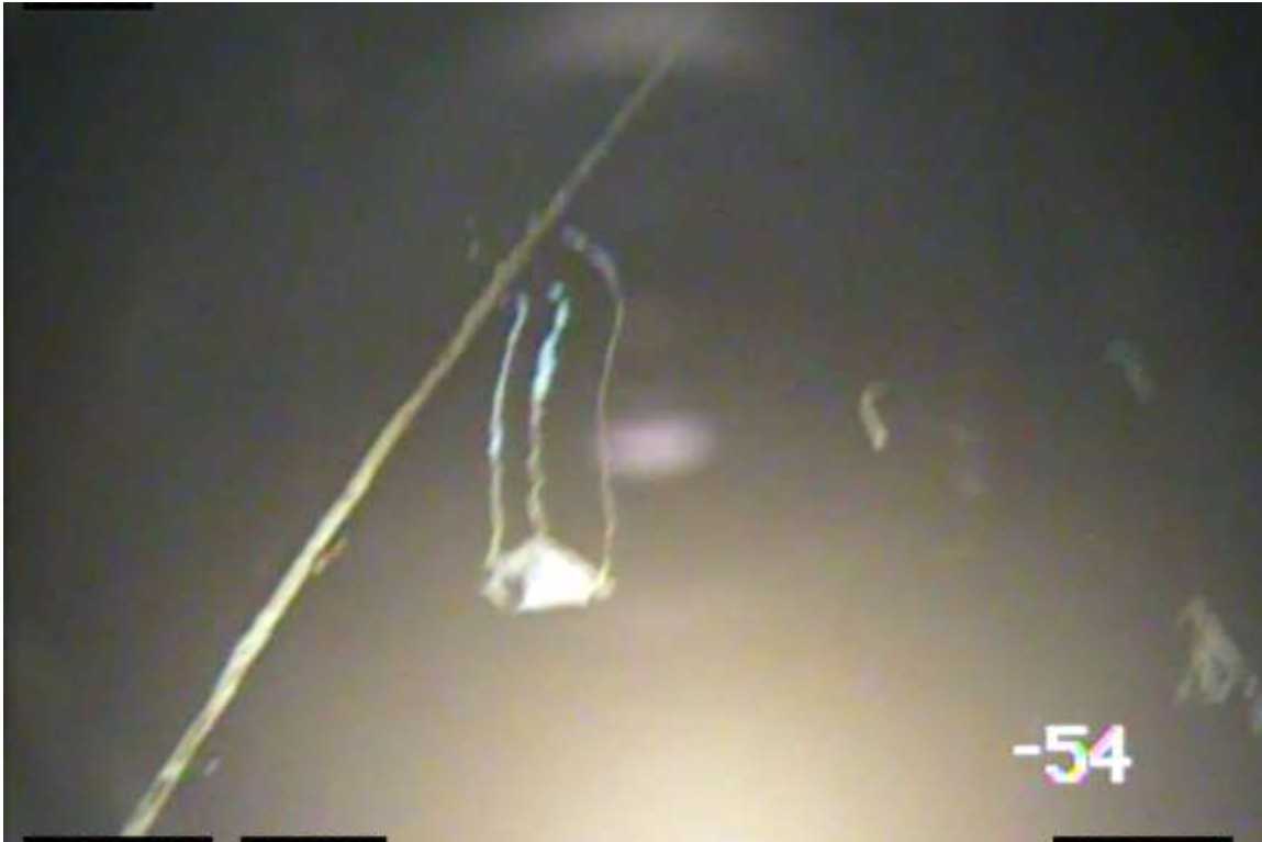
Photo shows the condition of the tank floor. If buckling is present we recommend stabilizing the floor by pumping grout to the underneath side of the floor where the buckling is occurring in compliance with NFPA 25-2017; 9.4.1 . This will be done by installing couplings in the tank floor, pumping grout at 15# psi, filling the voided areas to prevent any further buckling, then vacuum testing the floor. Any defective seams will be repaired by welding.