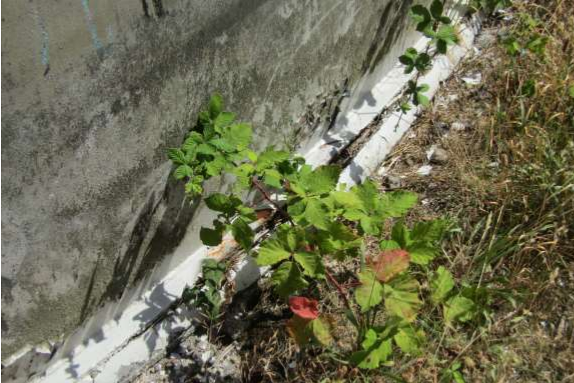
Photo shows the condition of the foundation. NFPA 22-2018; 12.2.1.2 states, "... the junction of the tank bottom and the top of the concrete foundation shall be tightly sealed to prevent water from entering the base." We recommend repairing any cracks and spalling in the concrete with a commercial non-shrinking grout, caulking/grouting around the base of the tank to foundation connection to prevent water from entering under the tank, then sealing the foundation with a sealant.