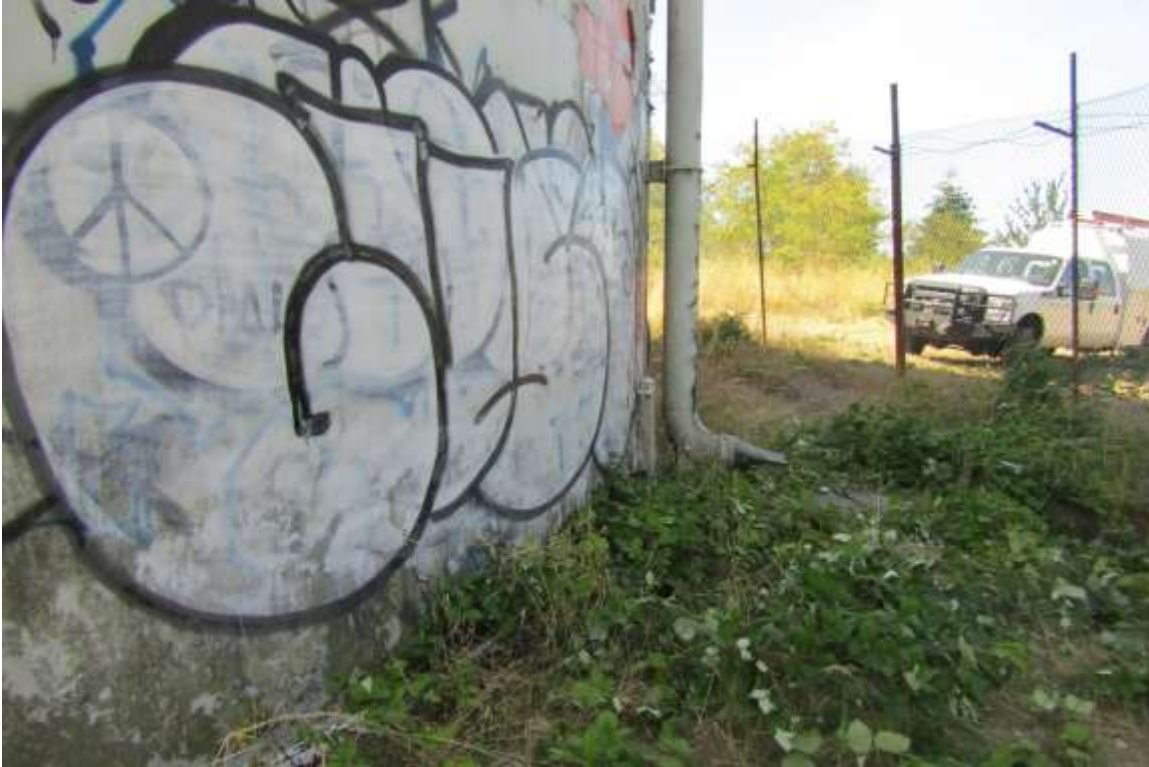
Photo shows the condition of the foundation. AWWA D100-11; 12.7.1 Height aboveground states, "The tops of the concrete foundations shall be a minimum of 6" above the finished grade, unless otherwise specified." We recommend clearing any dirt, debris and other loose gravel away from the tank foundation, down to a minimum 6" below top of foundation. This should be done by a local excavating company.