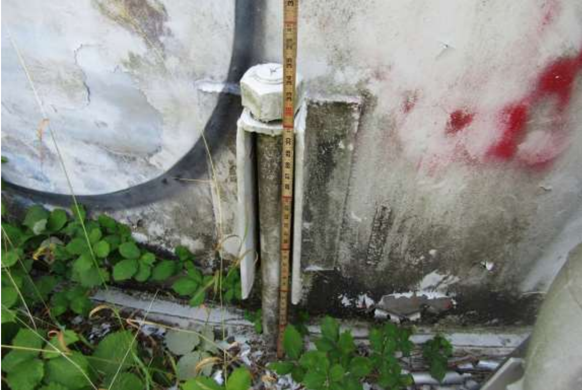
Photo shows the condition of one (1) of the six (6) anchor bolts. AWWA D100-11; 3.8.1.1 Required anchorage states, “For ground-supported flat-bottom reservoirs and standpipes, mechanical anchorage shall be provided when the wind or seismic loads exceed the limits for self-anchored tanks.” We recommend cleaning the area around the anchor bolts, tightening the anchor nuts, then tack welding the circumference of the nut-to-base plate connections and bolt-to-nut connections to reinforce.