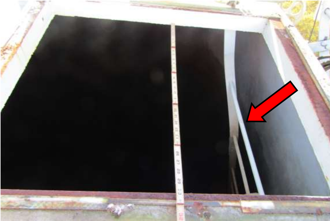
Photo shows the condition of the 30" primary roof hatch. AWWA D100-11; 7.4.3.1 states, "The opening shall have a curb at least 4 in. (102 mm) high, and the cover shall have a downward overlap of at least 2 in. (51 mm)." Roof openings on this tank require the following to be in compliance with AWWA D100-11; 7.4.3 Roof openings and OSHA 1910.146(c)(2) Confined spaces .