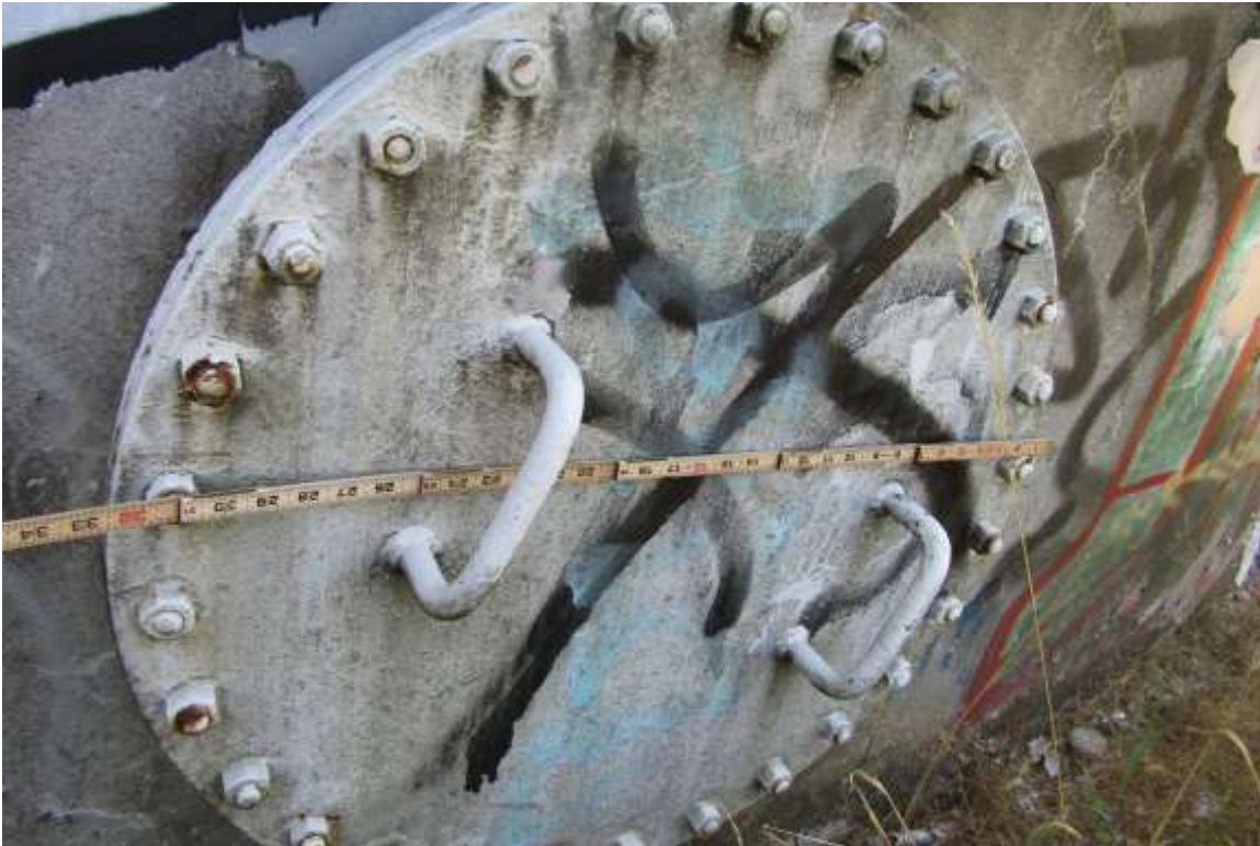
Photo shows the condition of the 24" primary shell manway. The following is required for the tank to be in compliance with AWWA D100-11; 7.4.4 Shell manholes , NFPA 22-2018; 14.7.2.1.1 and OSHA 1910.146(c)(2) Confined spaces .