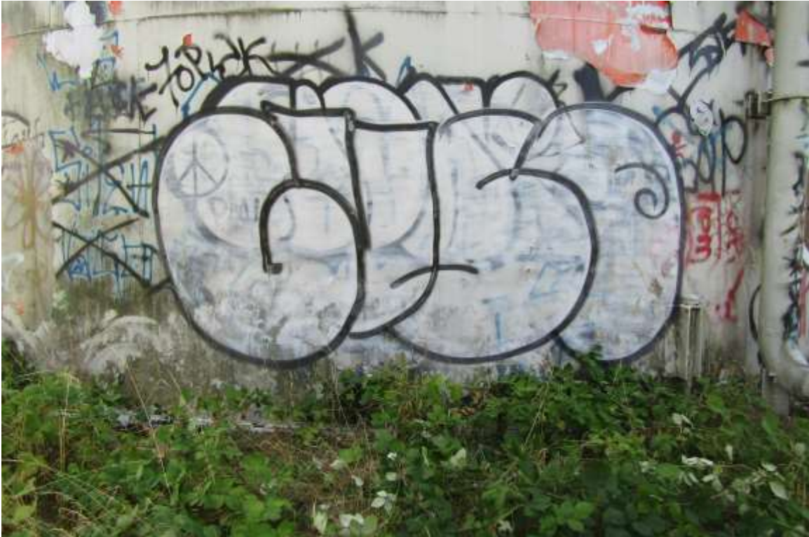
Photo shows the condition of the shell. Currently there is no drain valve. We recommend installing a frost proof drain valve near the shell-to-floor connection, complete with a locking device to prevent unauthorized draining of the tank and a splash pad to direct water away from the foundation. Splash pad to be installed by owner.