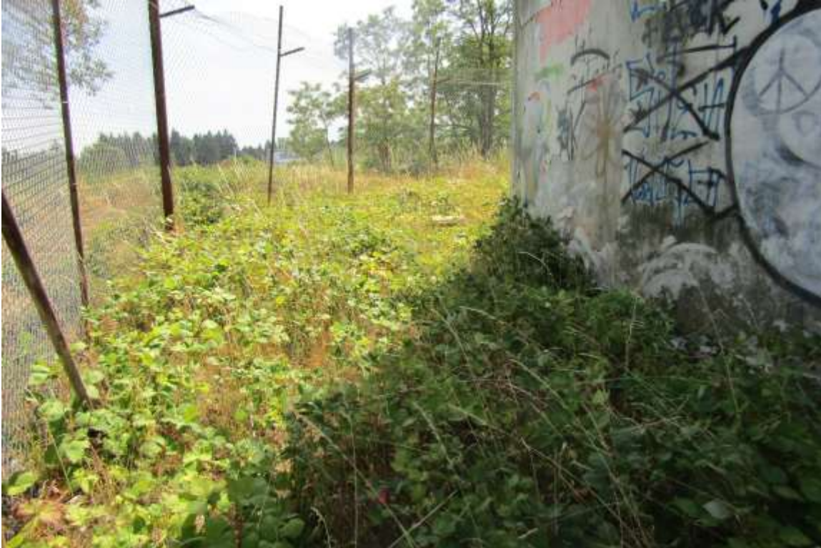
Photo shows the condition of the tank site. Notice the vegetation growth around the tank foundation. This could lead to deterioration of the structural components of the tank. OSHA 1910.176(c) states, "Storage areas shall be kept free from accumulation of materials that constitute hazards from tripping, fire, explosion, or pest harborage. Vegetation control will be exercised when necessary." We recommend removing the vegetation from around the tank foundation. This should be done by others.