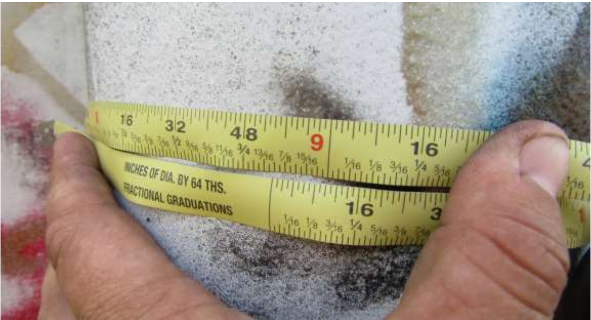
Photos show the 8" overflow pipe system, which is equipped with a flapper valve as required by AWWA D100-11; 7.3 Overflow.