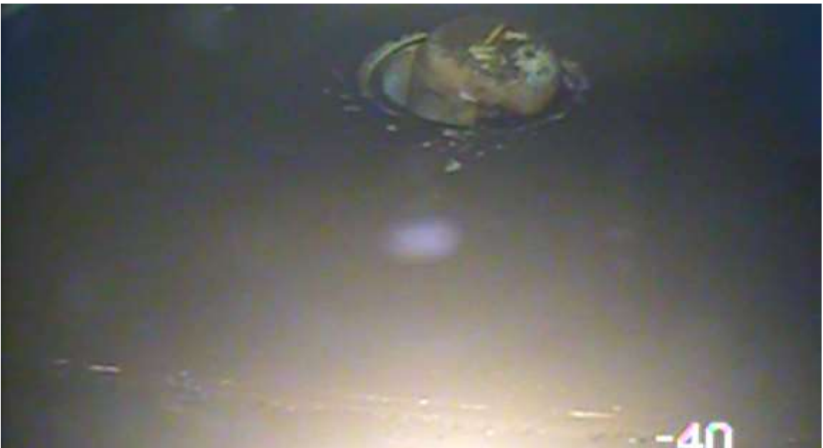
Photos show sediment in the tank interior prior to the performance of the tank clean out.