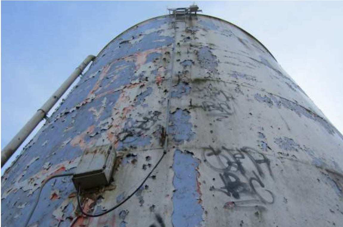
Photo shows the tank is not equipped with a liquid level indicator. NFPA 22-2018; 14.1.8* Water-Level Gauge states, "A water-level gauge of suitable design shall be provided. It shall be carefully installed, adjusted, and properly maintained." We recommend installing a liquid level indicator, complete with target board and float.