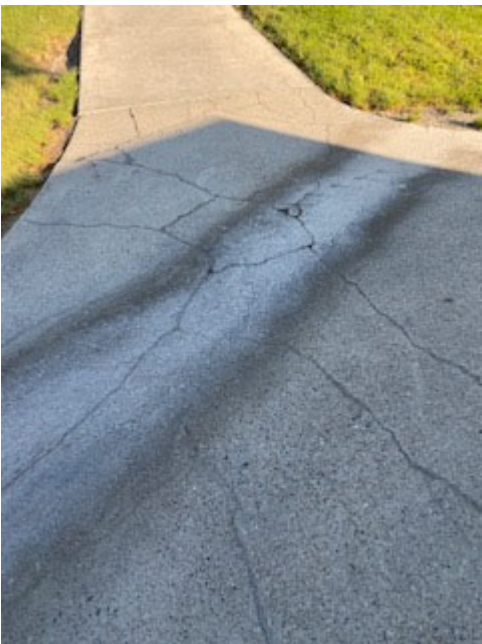
Typical concrete walk way with crack lines