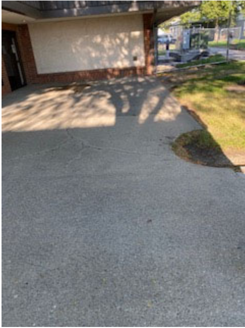
Concrete entrance way to the Food Service Building