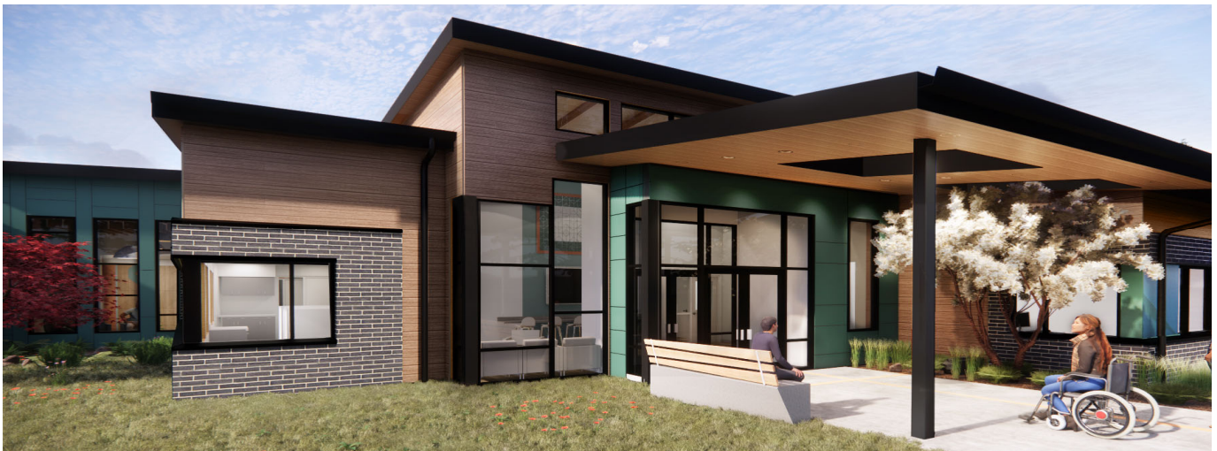
Design for New Community Civil Residential Treatment Facility by BCRA