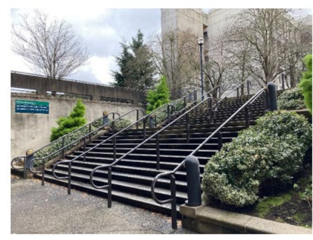
Walk up the stairs to OB2 entrance glass doors.