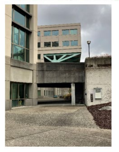
Pass under a walkway.