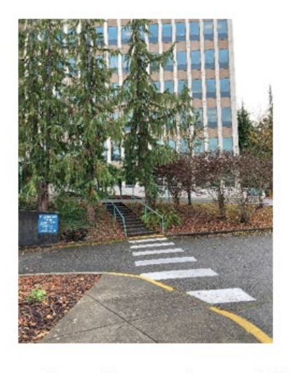
Walk up a few steps then turn left.