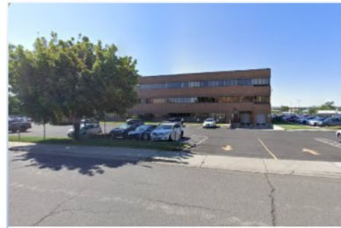
1002 N 16th Ave Building

Follow I-90 E and I-82 E/US-97 to N 16th Ave in Yakima. Take the N 16th Ave exit from US-12 W Follow N 16th Ave to W J Street