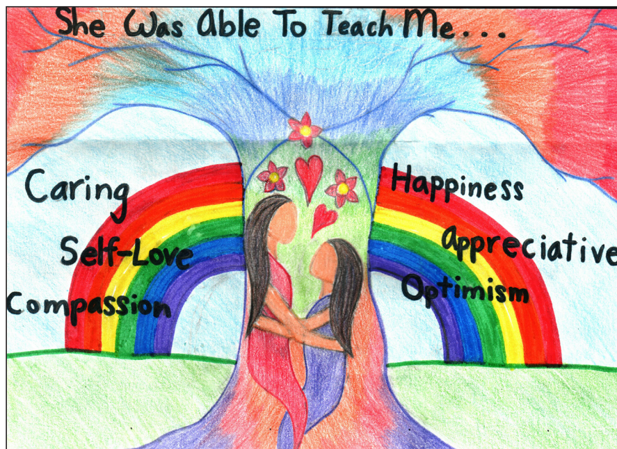
Angelia, Age-15. Artwork for the Cover of the 2019 booklet.